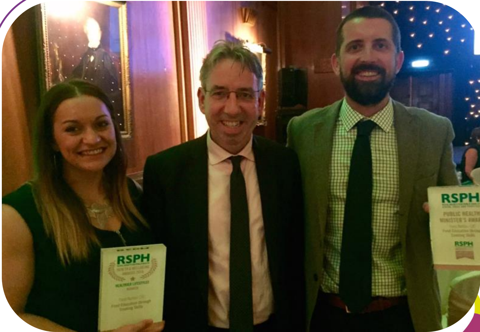
RSPH Minister of Public Health Award....